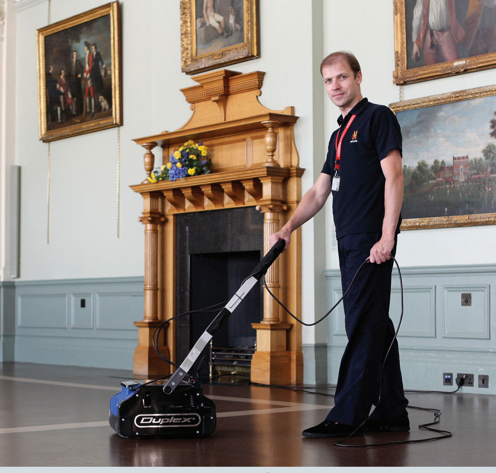
Request an on-site demonstration